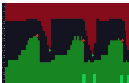
Figure 1: Layering/spoofing visualized in a spread graph. AFM Smarts

Many market participants that operate in the financial markets are highly automated and can react very quickly to market events and changes in the order book. This, for instance, enables them to always issue the best market price. In certain situations these participants may be turned into issuing higher or lower prices.